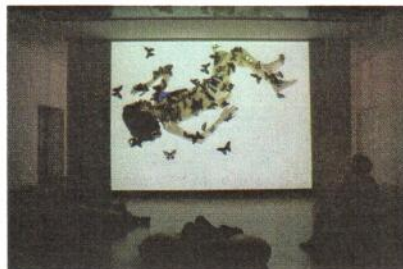
Nymphalis Antiopa, video projection, 2007-2008