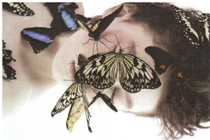
Nymphalis Antiopa II photographic work 2007-2008